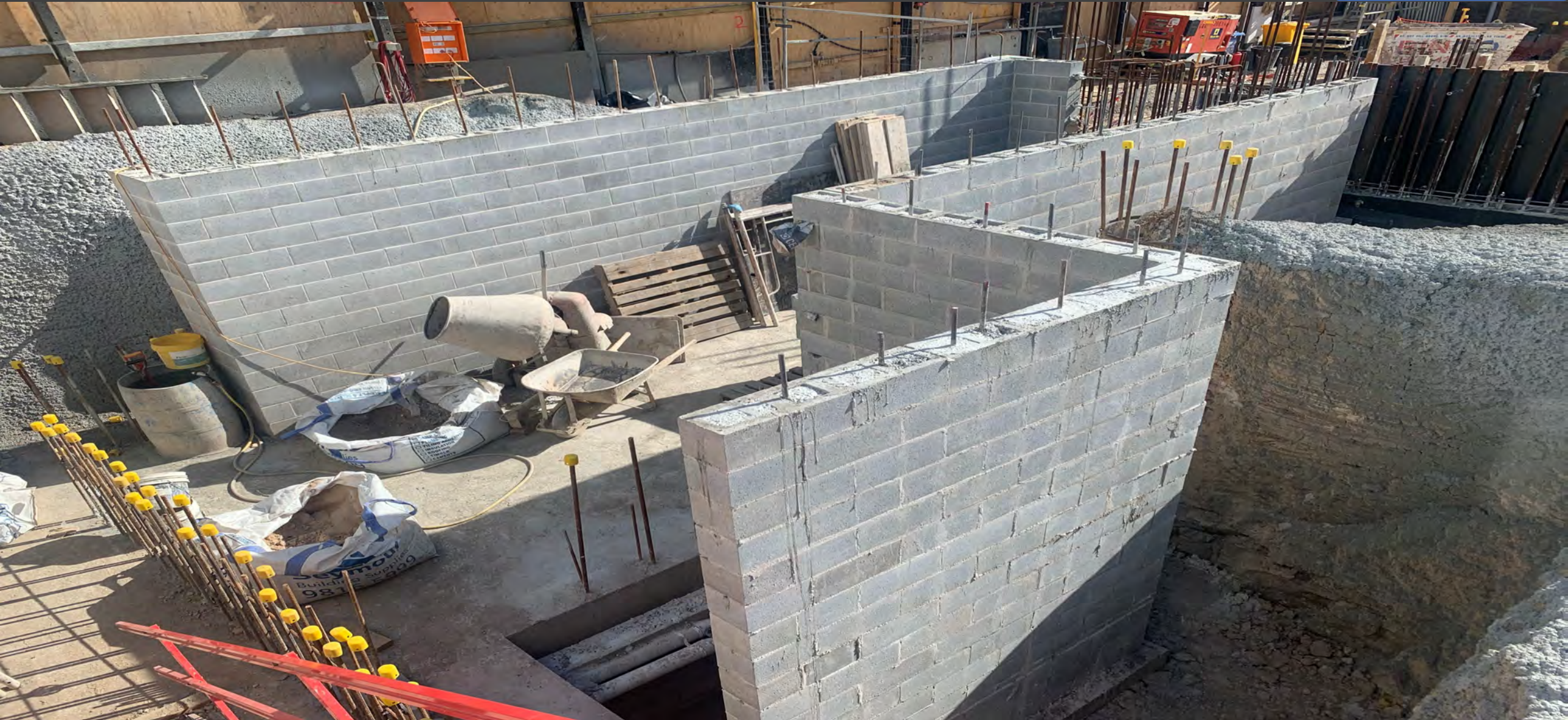
Eastwood Carpark— Belmadar Stakeholder Communication